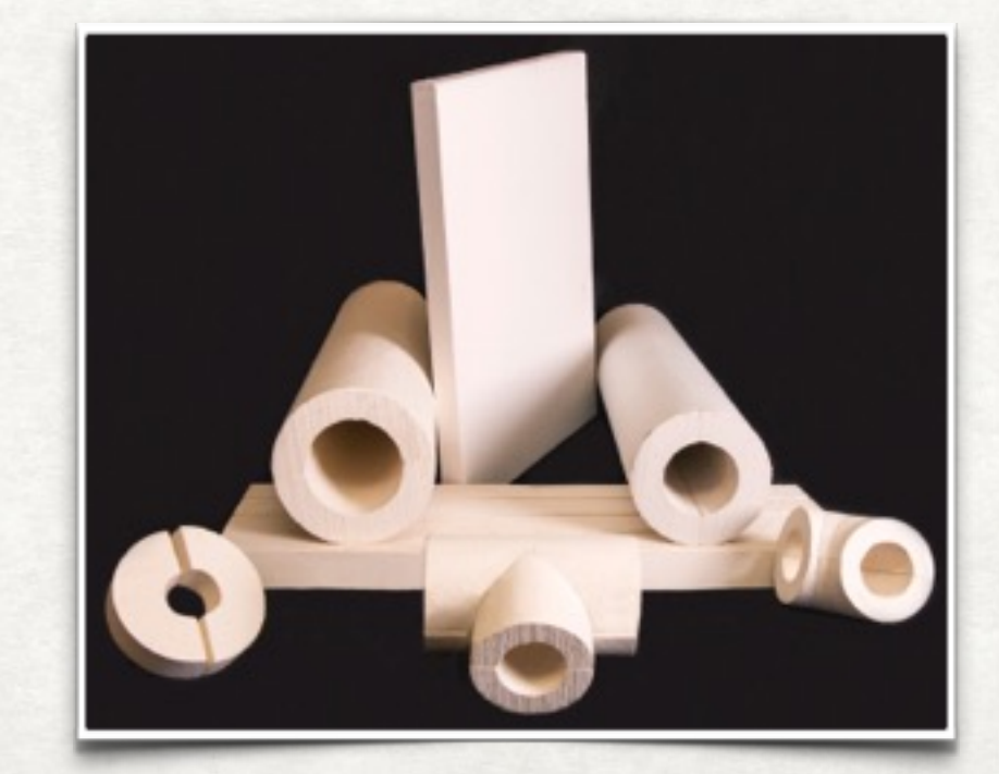
Thermal Pipe Shields Inc. +1.833.4CALSIL (422-5745)